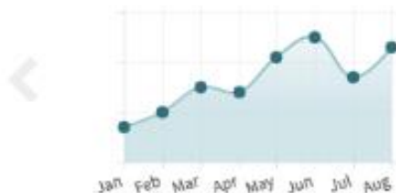
Today's Median Home Price